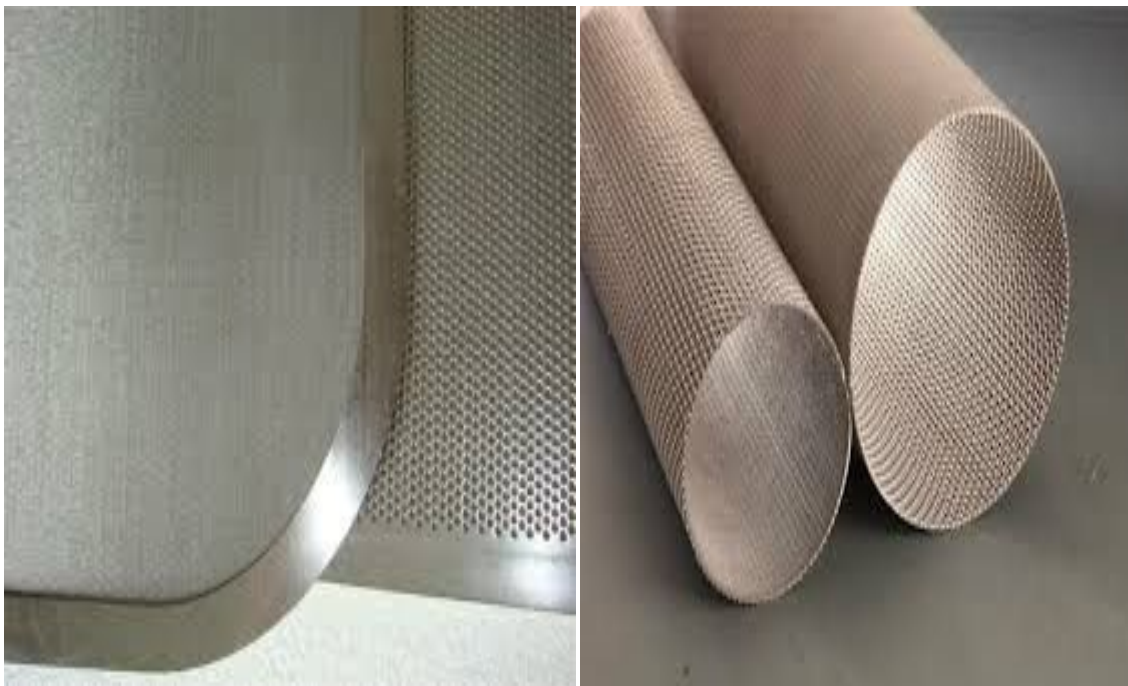
FeCrAl Sintered Mesh

Iron-chromium-aluminum (FeCrAl) woven wire heating mesh and cloth products offer excellent service. Heanjia Super-Metals is providing customers with specifically excellent service from the moment they place an order to the time of material delivery. Our objective is to make every client, a delighted and satisfied client.