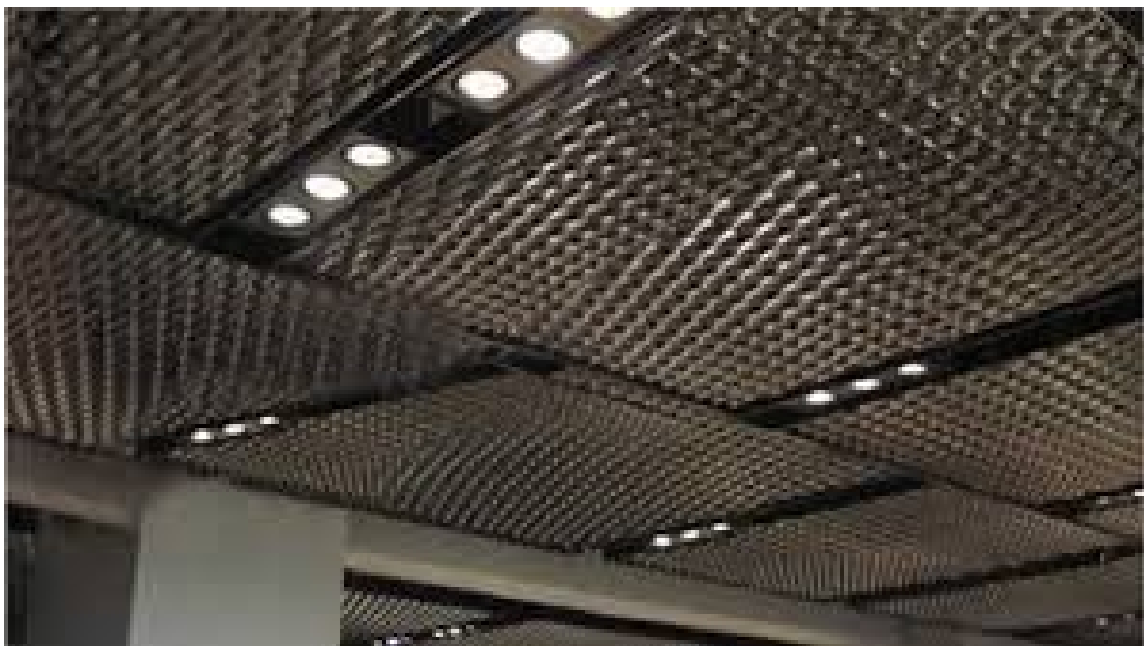
Stainless Steel 310 Expanded Metal

Heanjia Super-Metals do not only maintain the extensive industrial mesh stocks, we also offer our customers weaving and fabrication performed inside our production units. We are a specialist in OEM programs to improve our customer's experience. If you are looking for custom fabricated mesh with the specific needs, our professional custom mesh fabrications